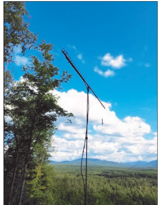
Note the wrench being used as a counter balance. On 23cm. The attached hardline is so heavy that the boom tilted up at an 15 degree angle and we spent several minutes to find a viable solution. It was John, who came up with idea of the counterweight. Worked perfectly!

We began our work early Saturday morning setting up antennas plus two stations for 222, 432, and 1296MHz that included a couple of expected interruptions along the way, which resulted in a late start. The combined 1.25m/70cm station consists of a Yaesu FT991 transceiver, Down East Microwave 222 -28L transverter, Henry 2002 500W 222MHz PA, and Mirage D-1010N, 100W 70cm PA. For 23cm, we used a K3 transceiver, and SSB Electronics LT-23S 10W transverter. The antenna complement includes M2 222-10EZ 10 element 222 Yagi, K1FO DSE432-15 70cm rover Yagi, and DSE2345LY 45 element loop Yagi for 23cm. Two antenna supports were used. They are Penninger 32ft Tipper mast with G-450 Yaesu rotor supporting 222 and 432 antennas, and a painter's pole supporting the 1296 antenna.